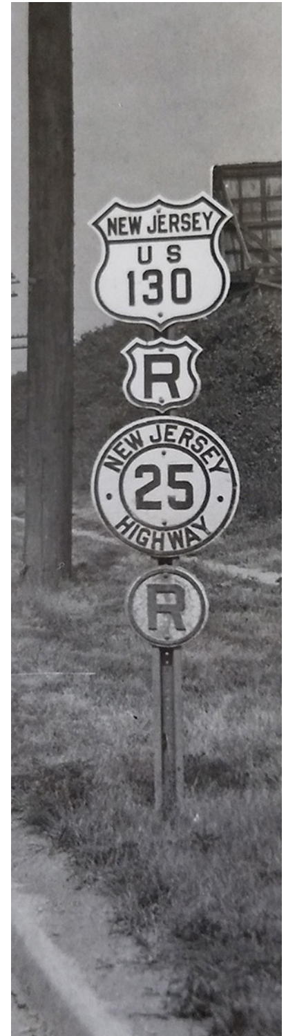
Early Rte. 130 signage, from 1947.

We haven't finished with East Windsor. There are many more stories to tell, and the need to tell even these stories more fully.