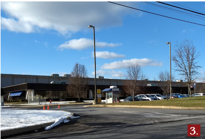
HIGHTSTOWN-EAST WINDSOR HISTORICAL SOCIETY